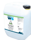
PN. 062511 Welding coolant - 5 l