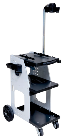
PN. 051331 + 052284 UNIVERSAL 800 + Over hanging arm