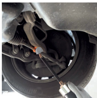
Releases steering linkages