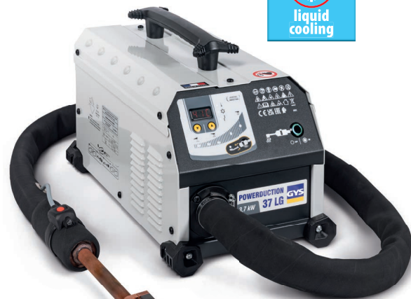
Supplied with a complete inductor 90°